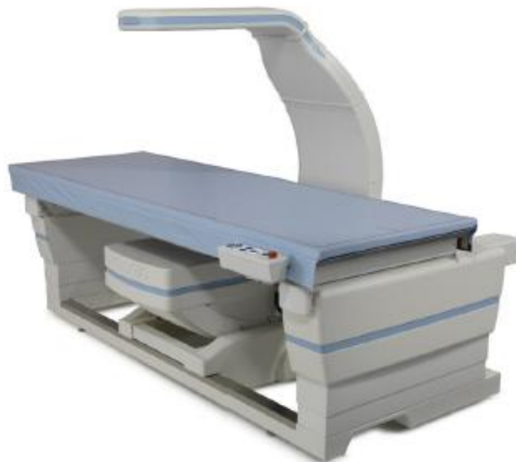
A bone density (DEXA/DXA) scanner.

Visit theros.org.uk/diagnosis for more information about scans and tests.